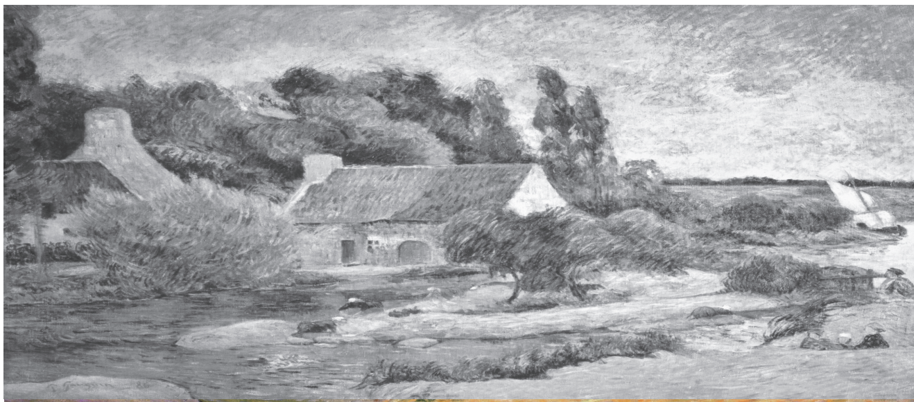
Washerwomen Of Pont-Aven, used with permission

For more on the Task Force, including its full report go to: http://www.scenichudson.org/ourwork/riverfrontcommunities/waterfrontresiliencetaskforces/piermont .