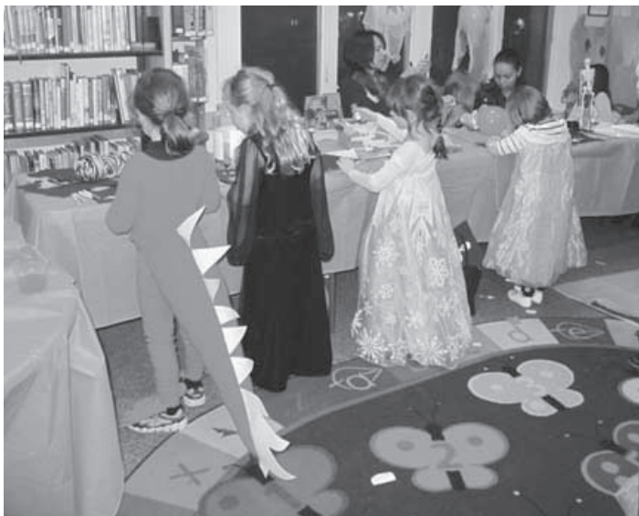
Halloween fun at the library.

If you've never used the Digital Download Center and would like to learn how to use this service, stop by the Piermont Library on Wednesday, January 14 at 6:30 pm for our program, Digital Downloads Demystified. During the course of this one hour training session, you will learn how to access the Library's Digital Download Center, how to search for digital books and how to manage your digital account. You will also learn how to navigate the Digital