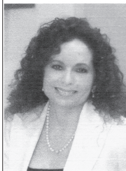
Owned And Operated By NRT LLC.

This issue of The Piermont Newsletter , and many past issues, can be found online at http://www.piermont-