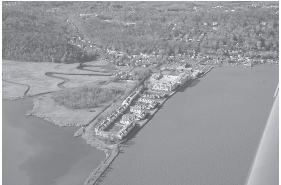
A partial view of our marsh and waterfront from the air.